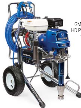
GMAX II 7900 HD ProContractor 17E842

Selecting the right spray equipment is critical to your business. You need a sprayer that can tackle your current jobs, but also one that gives you room to grow by expanding your capabilities. With an HD sprayer, you'll have the confidence that you'll always have the right sprayer – no matter the job!