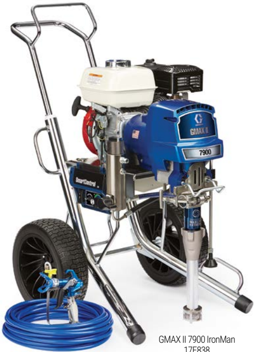
GMAX II 7900 IronMan 17E838

IronMan Series sprayers also include all Standard Series features: