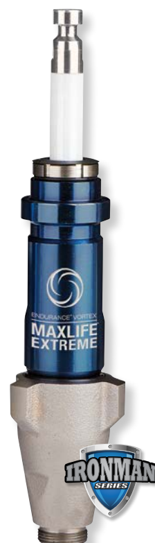
Endurance Vortex MaxLife Extreme Pump Extends pump rod life by 3X – delivering the industry's lowest cost of ownership