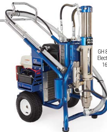
GH 833 with Electric Start 16U288