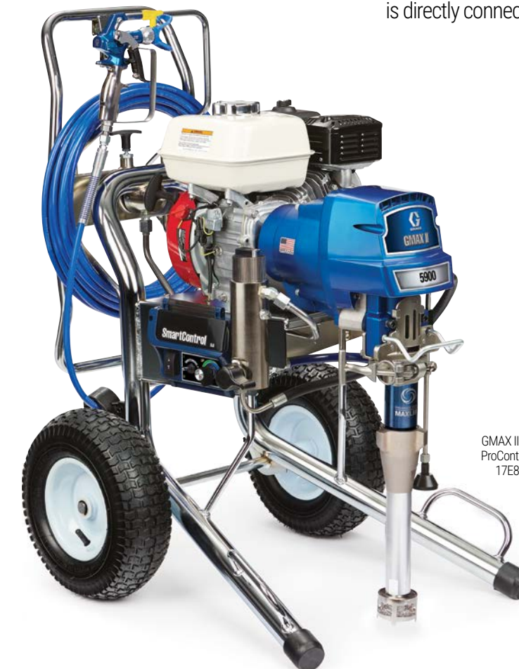
GMAX II 5900 ProContractor 17E832

Through our exclusive Direct Drive technology the fluid pump is directly connected to the engine, saving you money!