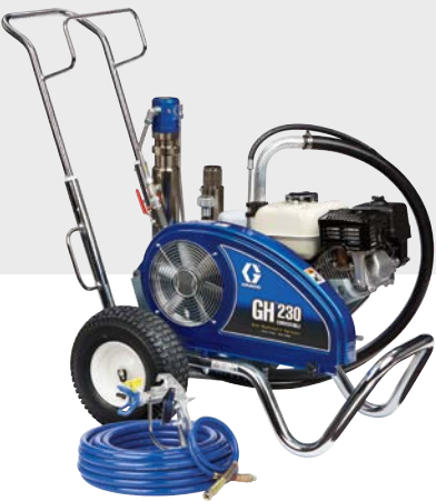
GH 230 Standard 24W929