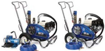
Ready to spray: Complete with Silver Plus Spray Gun, 15m Blue Max II Hose and RAC X LP517 SwitchTip