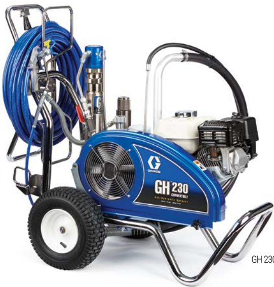
GH 230 ProContractor 24W932