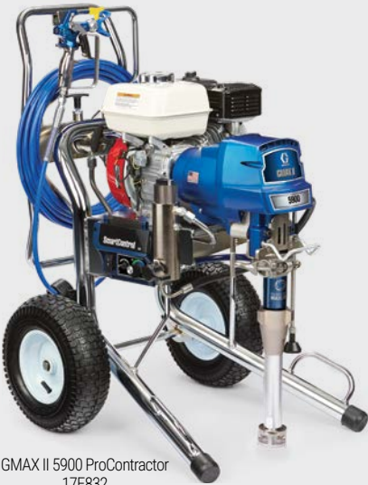
GMAX II 5900 ProContractor 17E832

ProContractor Series sprayers also include all Standard Series features: