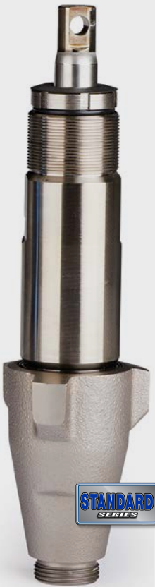
Endurance Chromex Pump for GH Lasts 2X longer than competing pumps

Graco's Standard Series sprayers deliver durability and performance for painting multiple projects a week, time after time.