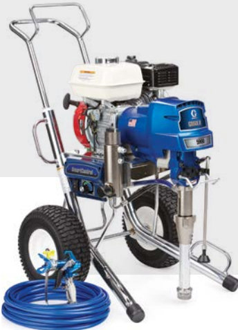
GMAX II 5900 Standard 17E831

GMAX II 7900 Standard Series Sprayer includes Graco's Endurance MaxLife Piston Pump: