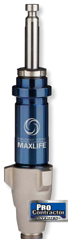
Endurance Vortex MaxLife Pump 6X longer between repacks