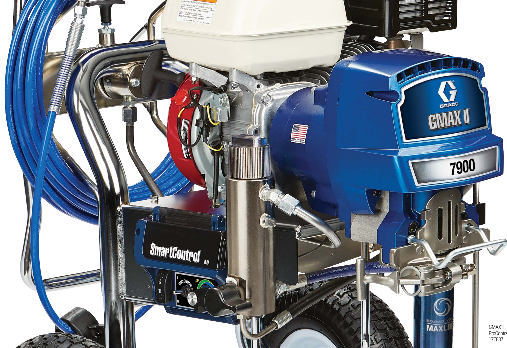
GMAX II 7900 ProContractor 17E837

Behind every Graco sprayer is the industry's strongest warranty. You may never need Graco's warranty — but if you do, we will be there.