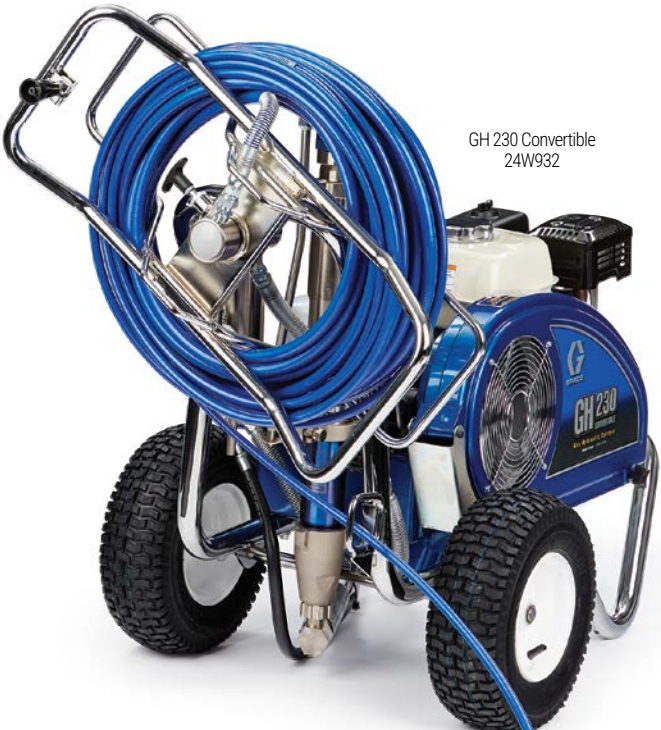
GH 230 Convertible 24W932