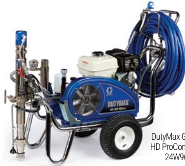
DutyMax GH 300 HD ProContractor 24W967