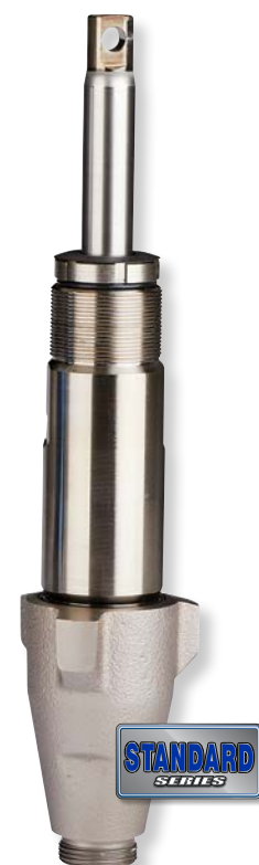
Endurance Chromex™ Pump Lasts 2X longer than competing pumps