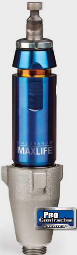
Endurance MaxLife Pump for GH 6X longer between repacks